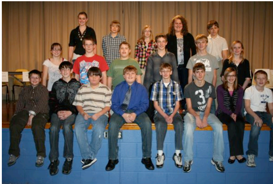
19 North Butler Middle School students competed in the National Geographic Geography Bee on Wednesday, Jan. 5.

For the 23rd year, the National Geographic Society is holding the National Geographic Bee for students in grades 4 - 8 in thousands of schools across the United States and in the five U.S. territories, as well as in Department of Defense Dependents Schools around the world. The 2011 Bee is sponsored by Google.